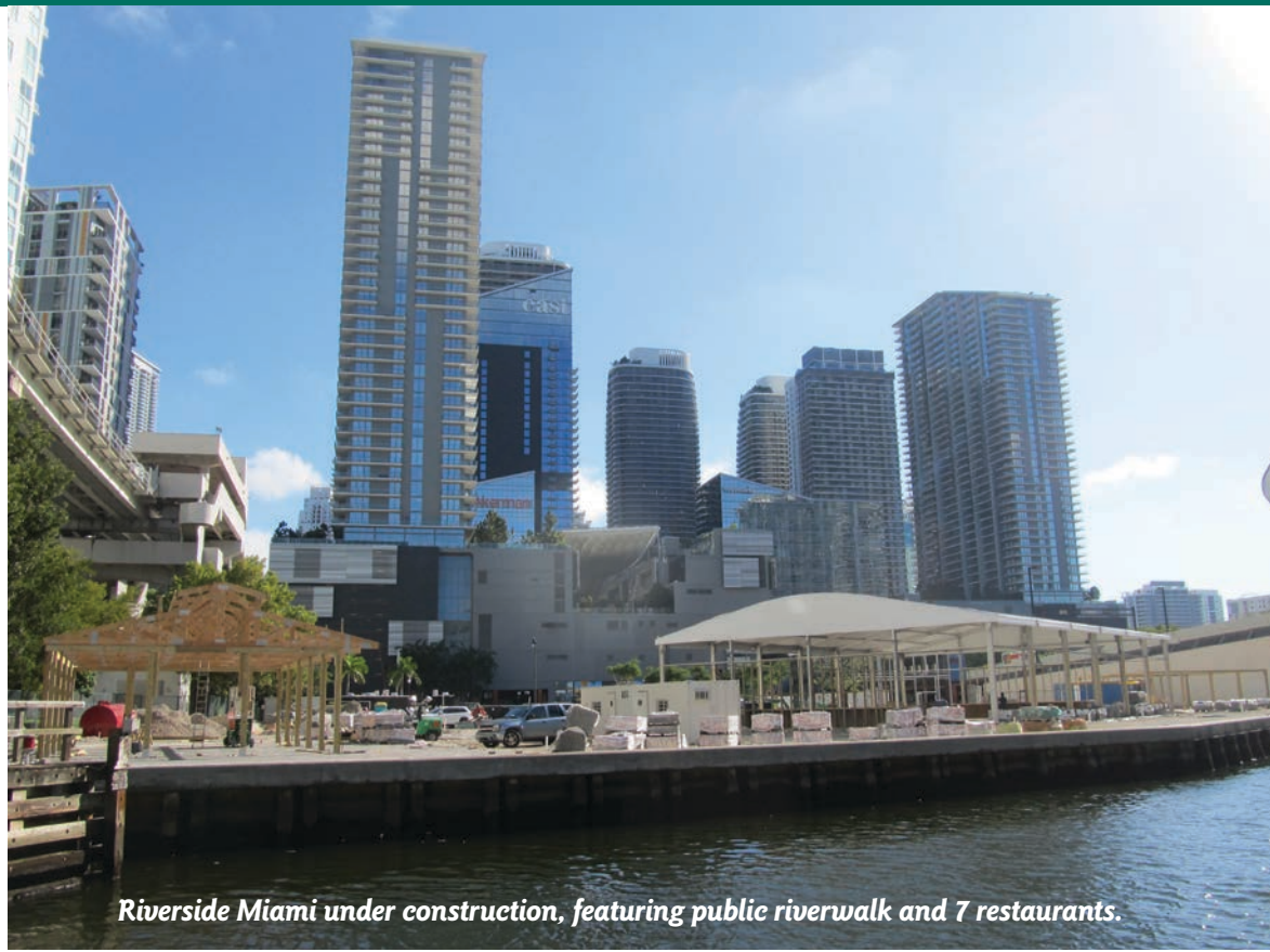
Riverside Miami under construction, featuring public riverwalk and 7 restaurants.