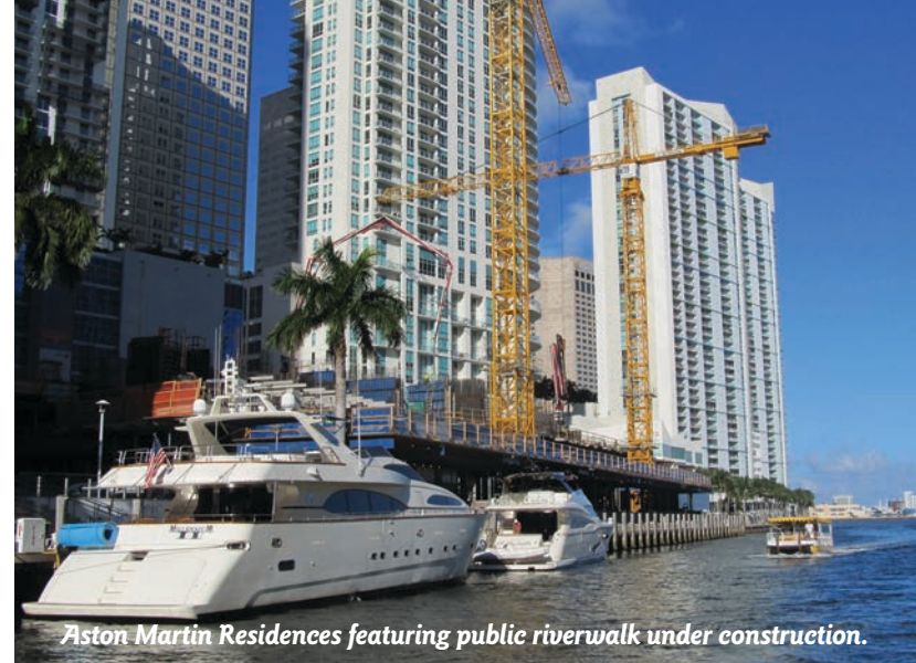
Aston Martin Residences featuring public riverwalk under construction.