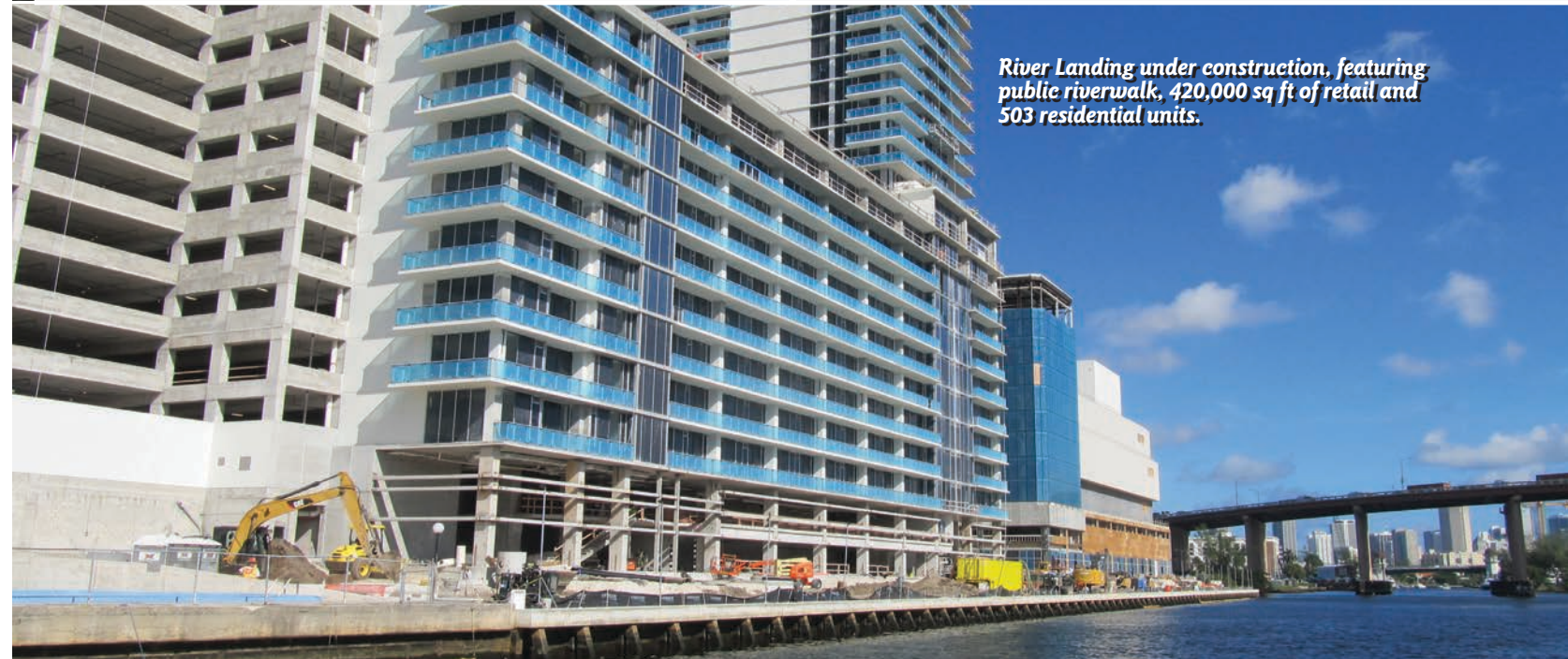
River Landing under construction, featuring public riverwalk, 420,000 sq ft of retail and 503 residential units.