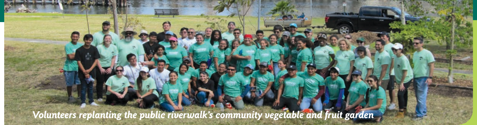
Volunteers replanting the public riverwalk's community vegetable and fruit garden

IN 2019, CONSTRUCTION CONTINUED at River Landing featuring 420,000 square feet of retail, 506 residential units and the public riverwalk, Aston Martin Residences featuring 384 residential units and the public riverwalk, Miami River Walk Apartments featuring 698 units and the public riverwalk, Riverside Miami featuring 7 restaurants and public riverwalk and renovations at RMK Merrill-Stevens shipyard, featuring a new seawall, infrastructure and ship lift. In addition, the MRC favorably received FDOT's “Miami River Freight Improvement Plan”. Therefore the Miami River District is ripe with mixed-use economic development, commerce and jobs.