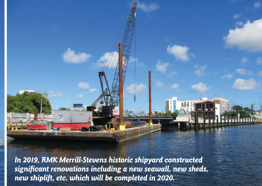
In 2019, RMK Merrill-Stevens historic shipyard constructed significant renovations including a new seawall, new sheds, new shiplift, etc. which will be completed in 2020.