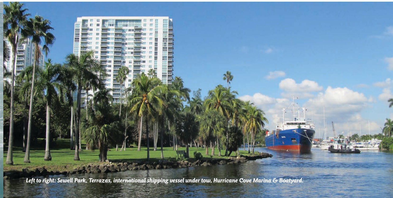
Left to right: Sewell Park, Terrazas, international shipping vessel under tow, Hurricane Cove Marina & Boatyard.