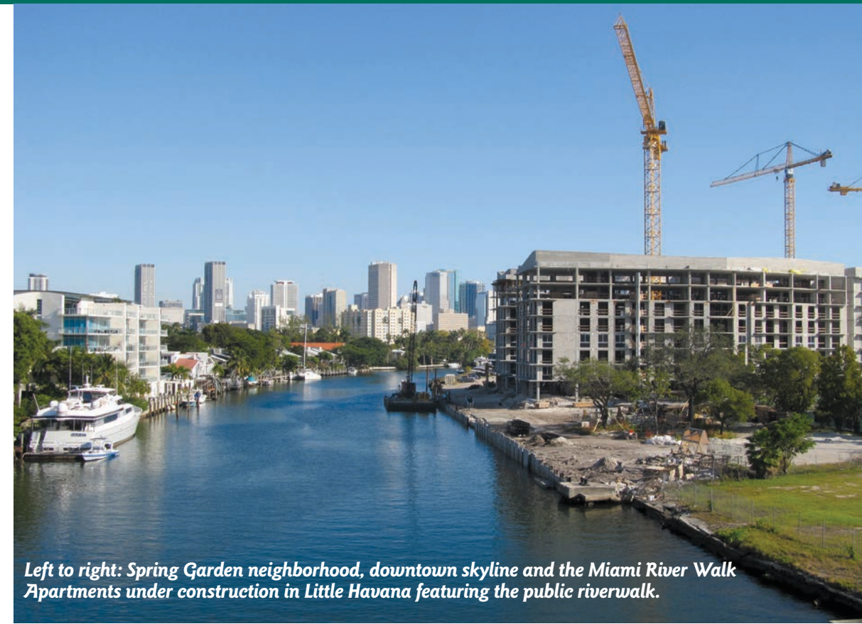
Left to right: Spring Garden neighborhood, downtown skyline and the Miami River Walk Apartments under construction in Little Havana featuring the public riverwalk.

identifies and encourages public and private sector riverfront parcels to address various riverfront issues which are potentially detrimental to operations on the River, the environmental quality of the River, and the River's attraction as a destination for residents, tourists and businesses. In 2019 alone, the Miami River "VIP" resulted in 24 major Miami River Greenway Beautification volunteer events featuring plantings, removal of illegal dumping, invasive species, and graffiti along several sections of the Miami River, removing derelict vessels, repairing Riverwalk lights, unclogging stormwater drains, removing a floating hazard to navigation and oil sheen, found and corrected sources of contamination etc. The MRC thanks Miami-Dade County, City of Miami, FIND, FDOT, private sector, and the fantastic volunteers for their hard work bringing these River improvements to fruition.