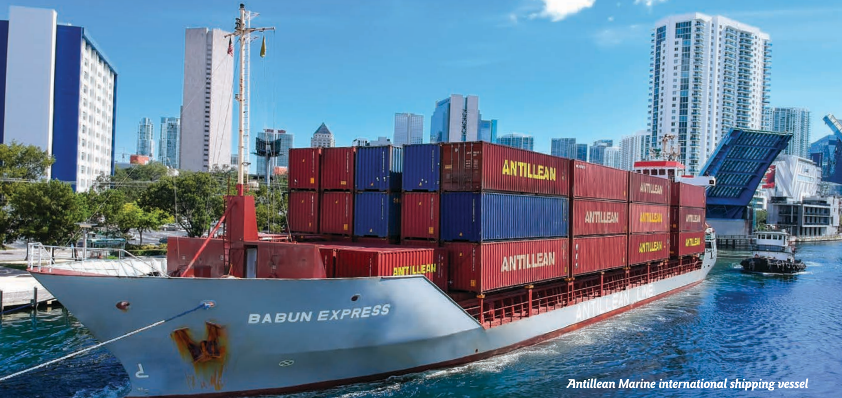
Antillean Marine international shipping vessel

Learn more about the Miami River's past, present and future, view reports, plans, public meeting minutes, agendas and more at the informative www.miamirivercommission.org