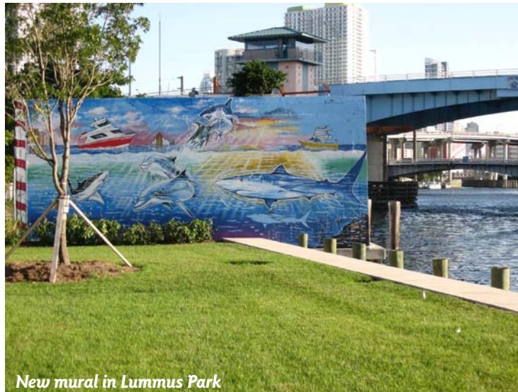
New mural in Lummus Park

The collapsed seawall adjacent to the ancient