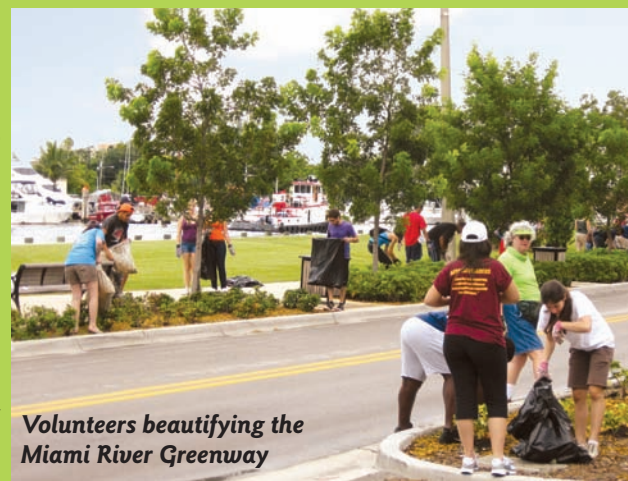
Volunteers beautifying the Miami River Greenway

All MRC and subcommittee meetings are publicly noticed. Public participation is encouraged. The full MRC meets on the first Monday of every month at noon, usually at the meeting room to the right of the MRC headquarters.