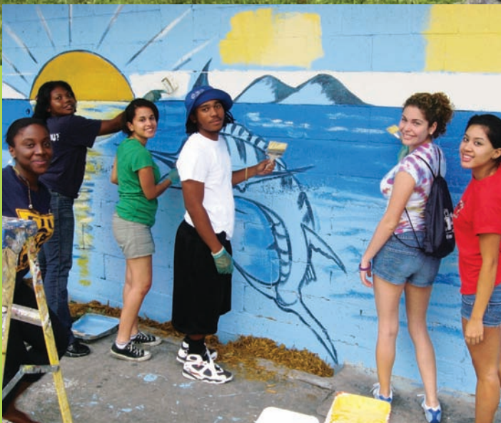
Volunteers painting mural along the Miami River Greenway

Volunteers plant the new vegetable and fruit garden with rain barrels and composter along the river's publicly-accessible south bank near the Miami River Commission's offices at 1407 NW 7th St. Volunteers are eligible to harvest and eat the fresh, healthy and free produce when it matures.