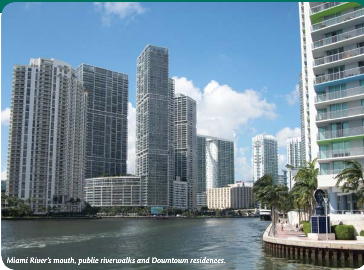
Miami River's mouth, public riverwalks and Downtown residences.