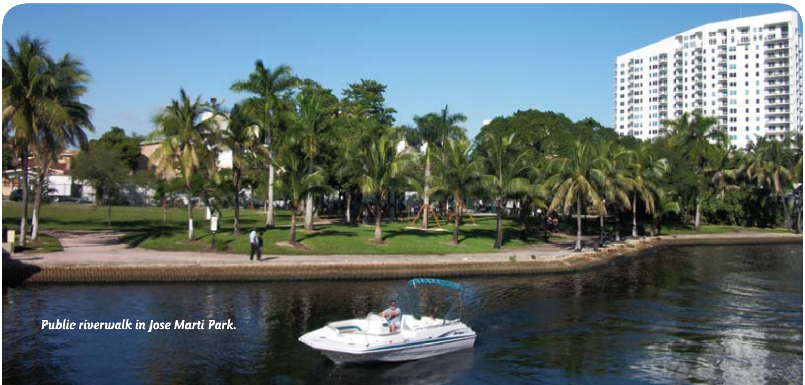
Public riverwalk in Jose Marti Park.

THE MRC'S URBAN INFILL SUBCOMMITTEE continued efforts to assist implementing various adopted and award-winning plans, including the Miami River Corridor Urban Infill Plan , Miami River Corridor Multi-Modal Transportation Plan , Miami River Greenway Action Plan and others, all available for downloading at www.miamirivercommission.org .