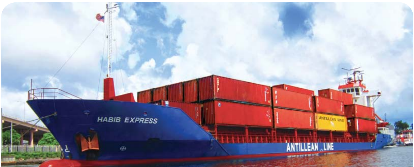
Antillean Marine's "Habib Express," the largest and fastest international shipping vessel operating from the Miami River.