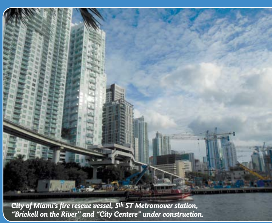
City of Miami's fire rescue vessel, 5 th ST Metromover station, "Brickell on the River" and "City Center" under construction.