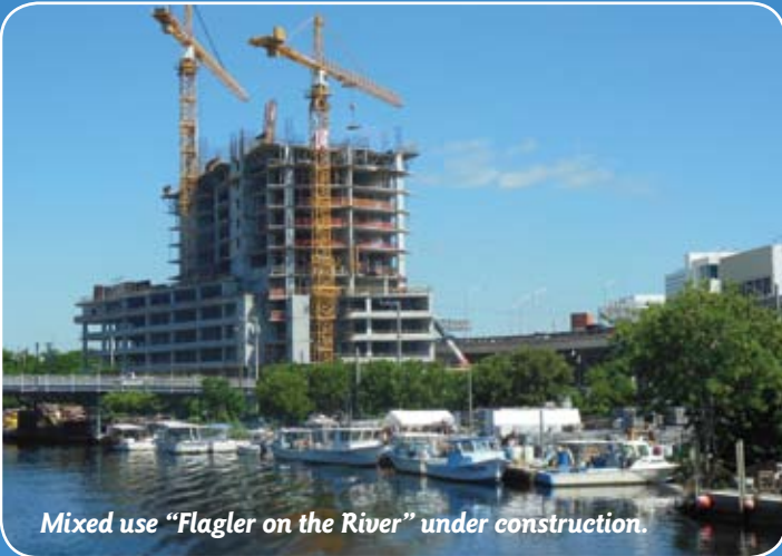
Mixed use "Flagler on the River" under construction.