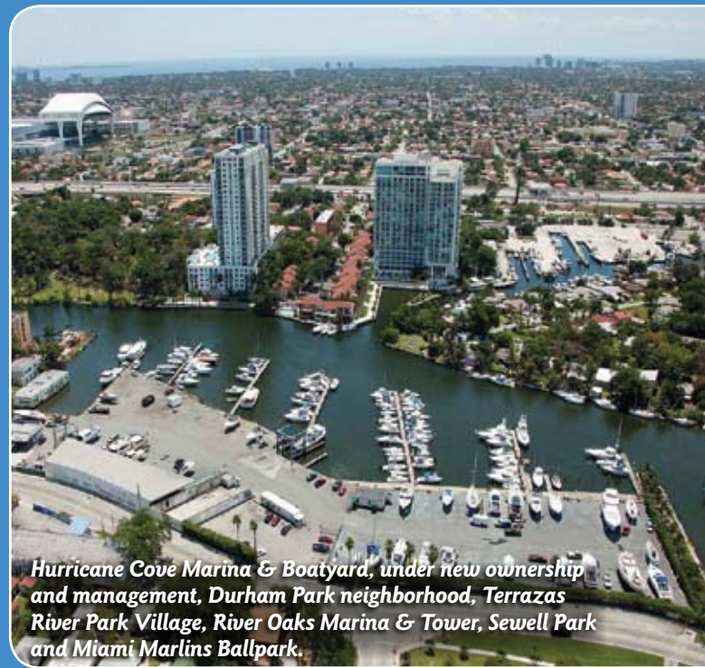
Hurricane Cove Marina & Boatyard, under new ownership and management, Durham Park neighborhood, Terrazas River Park Village, River Oaks Marina & Tower, Sewell Park and Miami Marlins Ballpark.