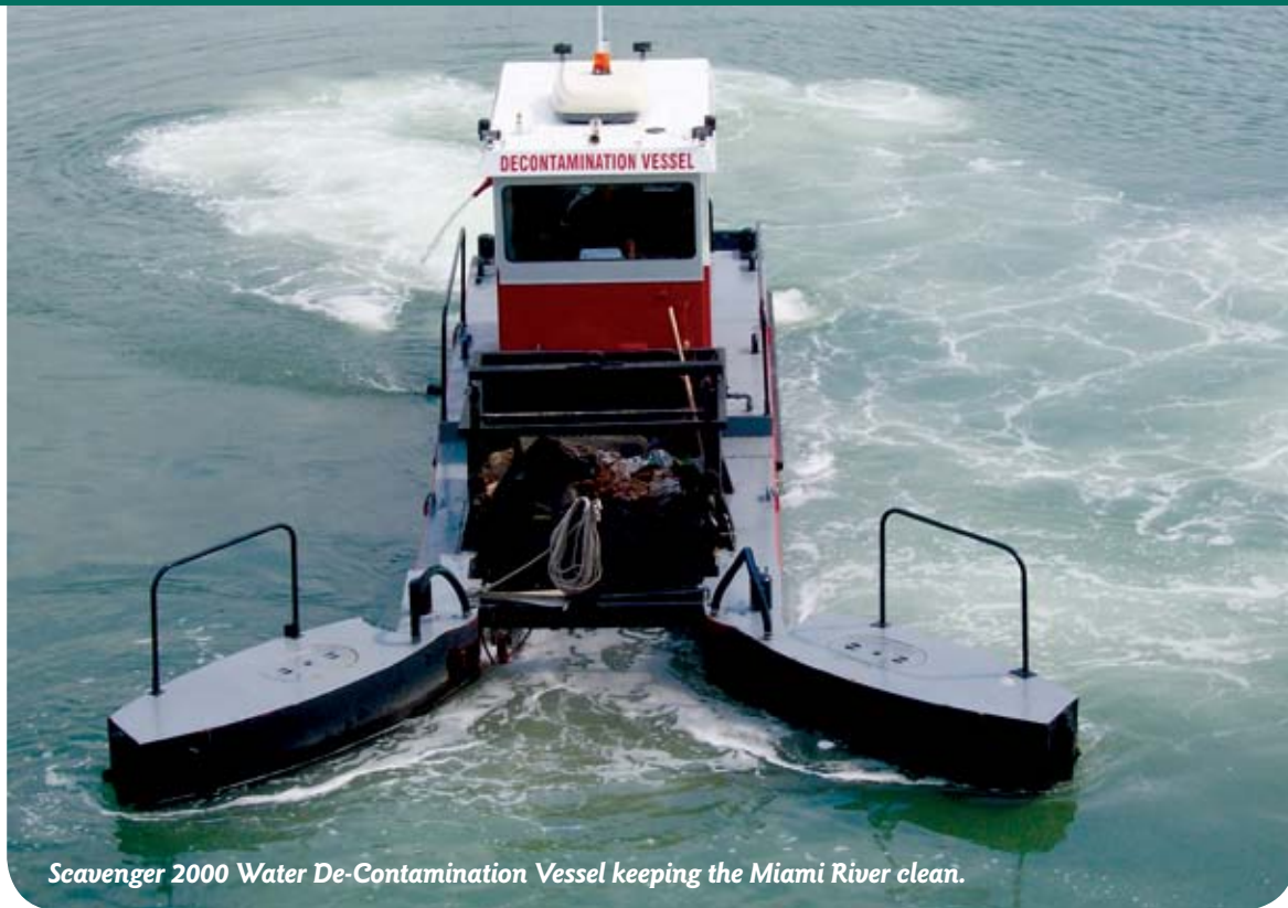
Scavenger 2000 Water De-Contamination Vessel keeping the Miami River clean.

Encourages public and private sector to address various riverfront issues complementary to operations on the River, and the continuation for residents, tourists and visitors. Along the Miami River "VIP" project, the removal of a derelict vessel, stopping of illegal activities, 16 Miami River Greenway events featuring removal of graffiti, cleaning of the species, and graffiti along the Miami River, repairing Riverwalk water drains, reopening Curtis Park, removing a floating hazard and filling a sinkhole on the Riverwalk, etc. Dade County, City of Miami, Miami-Dade Water Utility, and the estimated over two million people who have benefited from their hard work bringing these improvements to the River.