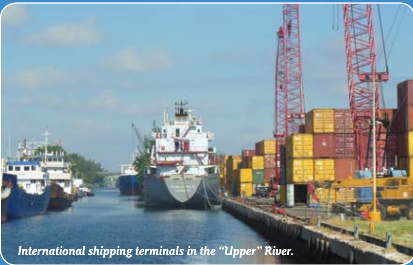
International shipping terminals in the "Upper" River.