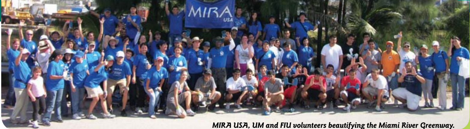
MIRA USA, UM and FIU volunteers beautifying the Miami River Greenway.