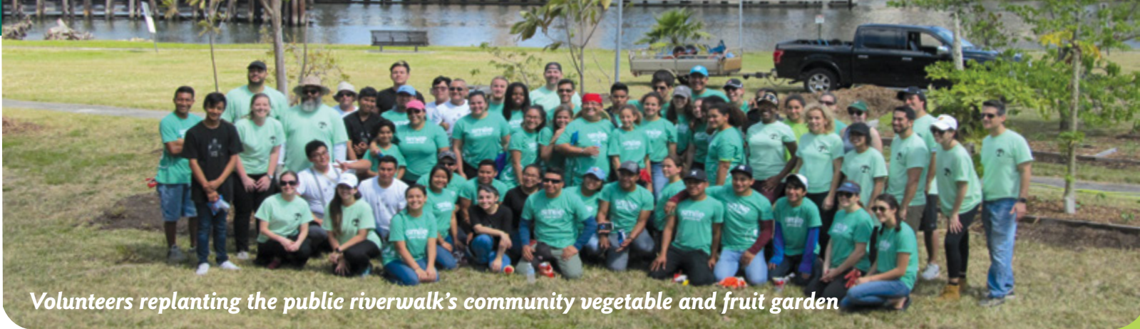
Volunteers replanting the public riverwalk's community vegetable and fruit garden