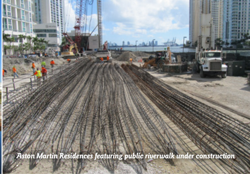
Aston Martin Residences featuring public riverwalk under construction