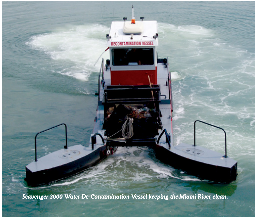
Scavenger 2000 Water De-Contamination Vessel keeping the Miami River clean.

IN 2018, CONSTRUCTION CONTINUED at River Landing featuring 420,000 square feet of retail, 506 residential units, and the public riverwalk, construction continued at Aston Martin Residences featuring 384 residential units and the public riverwalk, construction commenced at Miami River Walk Apartments featuring 698 units and the public riverwalk, and renovations are under construction at RMK Merrill-Stevens shipyard, featuring a new seawall, and new ship lift. In addition, the MRC favorably received FDOT's “Miami River Freight Improvement Plan”. Therefore the Miami River District is ripe with mixed-use economic development, commerce and jobs.