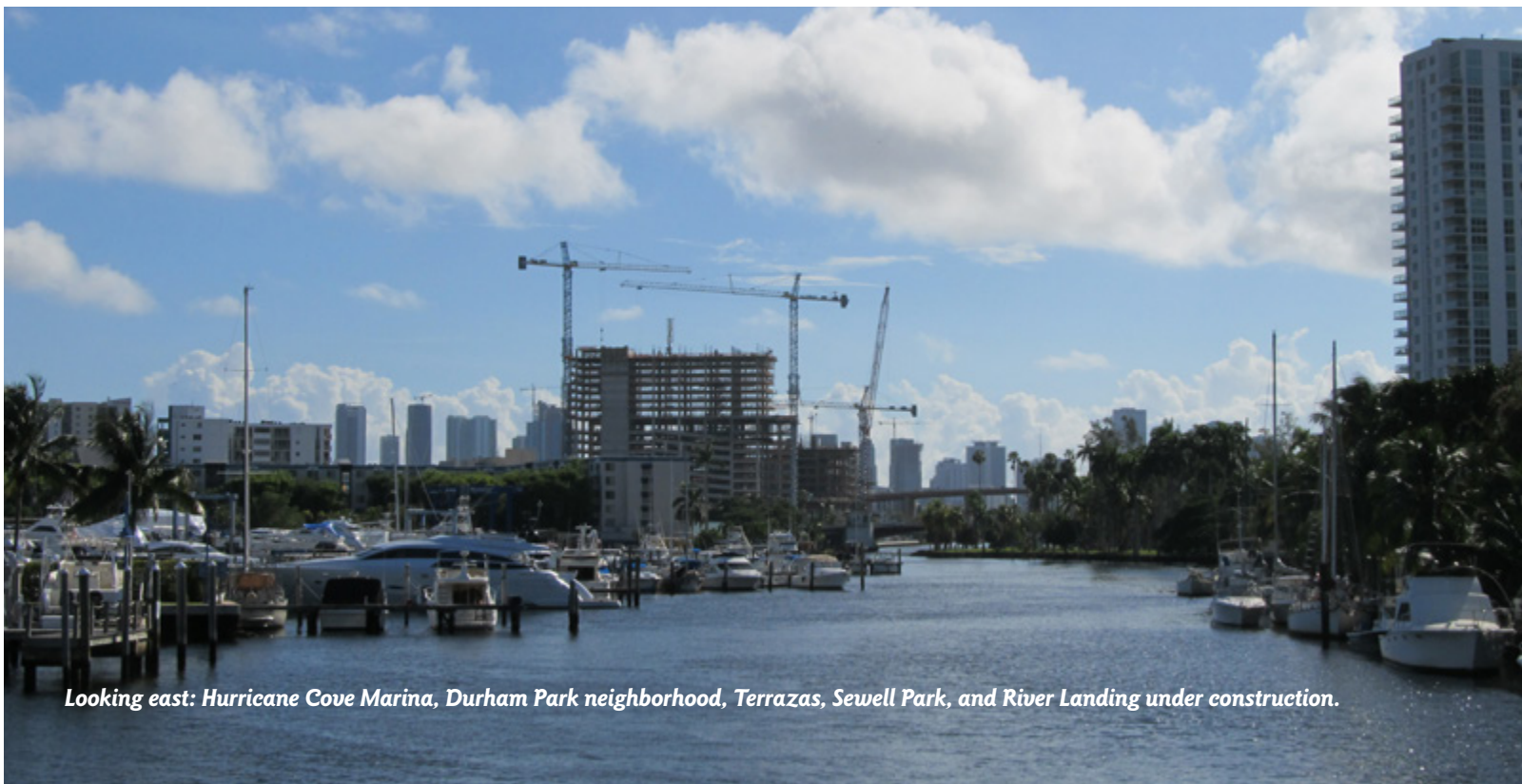
Looking east: Hurricane Cove Marina, Durham Park neighborhood, Terrazas, Sewell Park, and River Landing under construction.