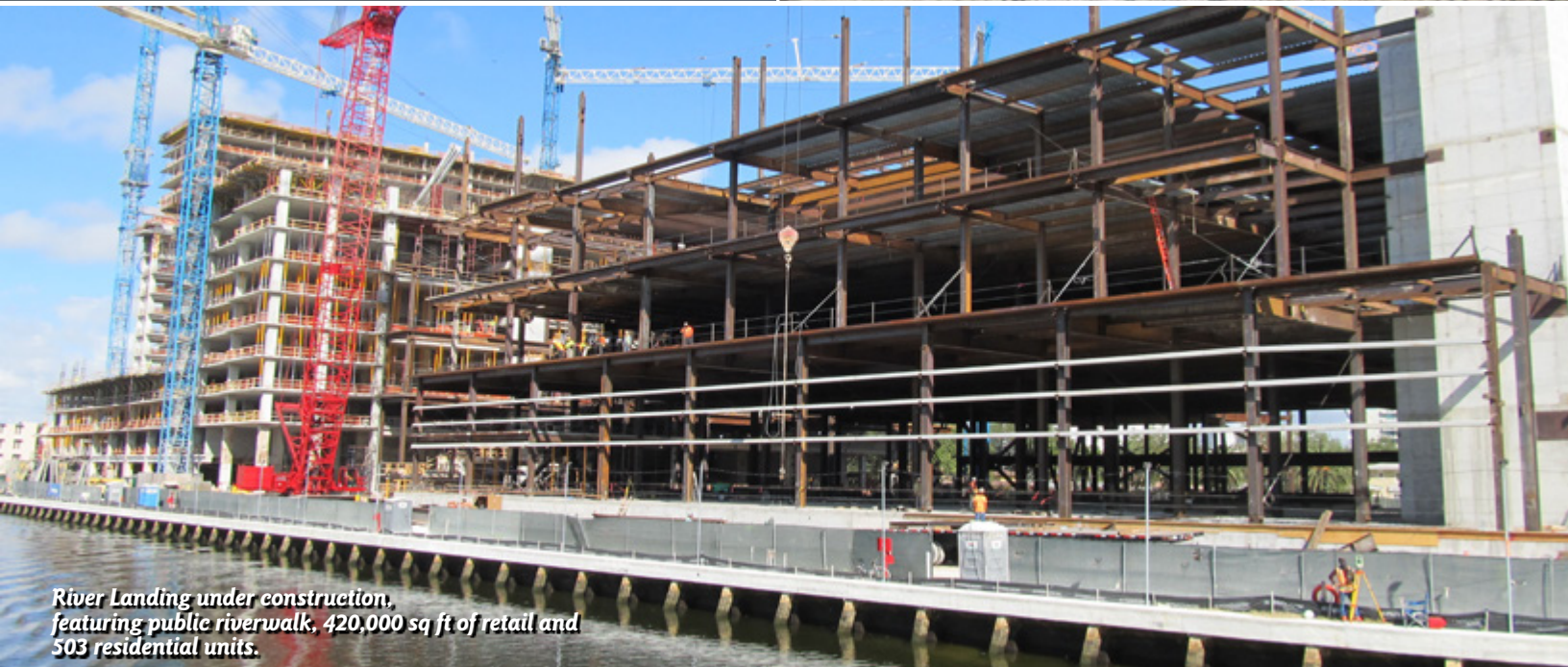
River Landing under construction, featuring public riverwalk, 420,000 sq ft of retail and 503 residential units.