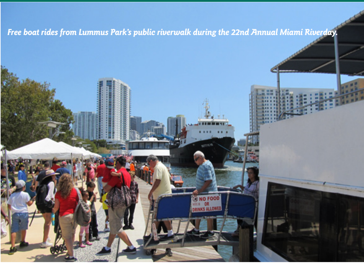
Free boat rides from Lummus Park's public riverwalk during the 22nd Annual Miami Riverday.