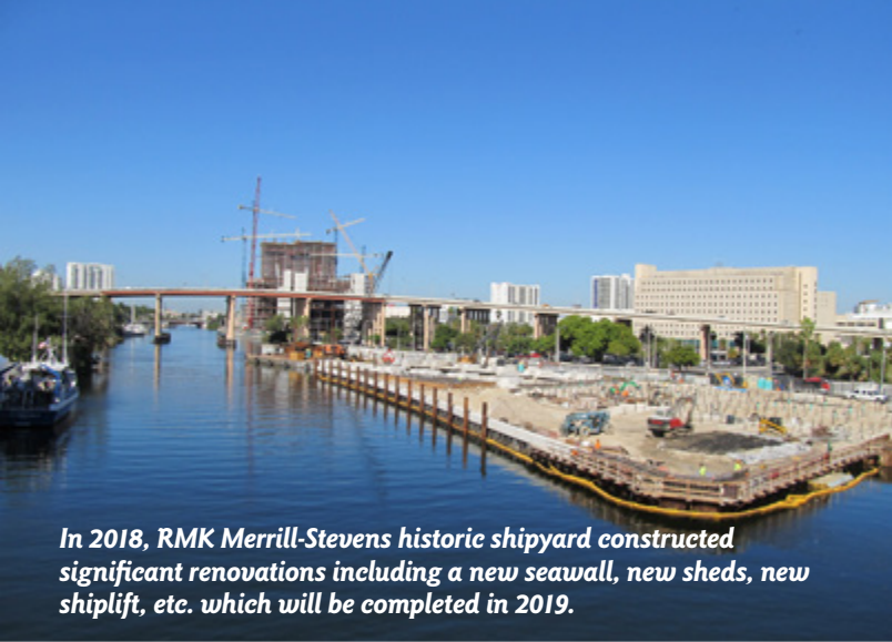
In 2018, RMK Merrill-Stevens historic shipyard constructed significant renovations including a new seawall, new sheds, new shiplift, etc. which will be completed in 2019.