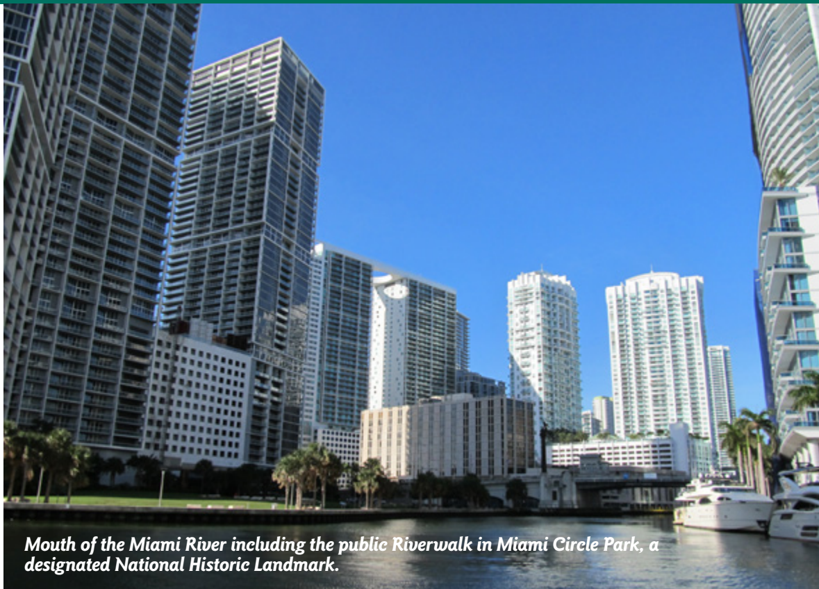
Mouth of the Miami River including the public Riverwalk in Miami Circle Park, a designated National Historic Landmark.

public and private sector address various riverfront issues from environmental to operations on the quality of the River, and the recreation for residents, tourists and boaters. The Miami River "VIP" River Greenway Beautification Program includes: tree plantings, removal of illegal parking and graffiti along several miles of river, removing derelict vessels, unclogging stormwater drains, improving navigation and oil sheen, and addressing issues of contamination etc. The Miami-Dade County, City of Miami, FIND, and the fantastic volunteers for their hard work and river improvements to fruition.