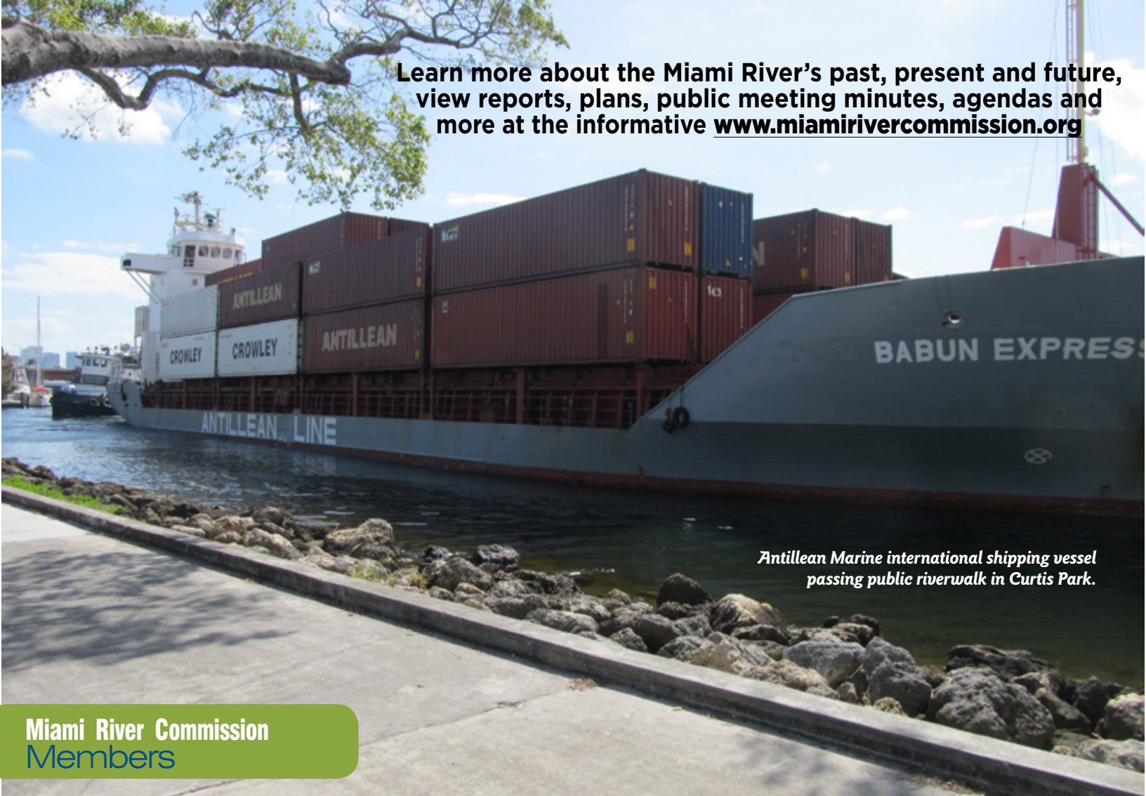
Antillean Marine international shipping vessel passing public riverwalk in Curtis Park.

Learn more about the Miami River's past, present and future, view reports, plans, public meeting minutes, agendas and more at the informative www.miamirivercommission.org